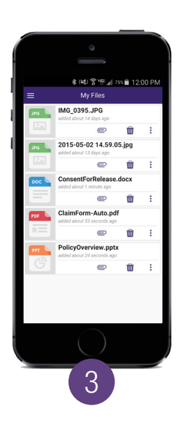
Choose one or more files to be processed, stored, printed, or shared.