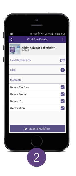
Tap on the workflow that you are interested in.