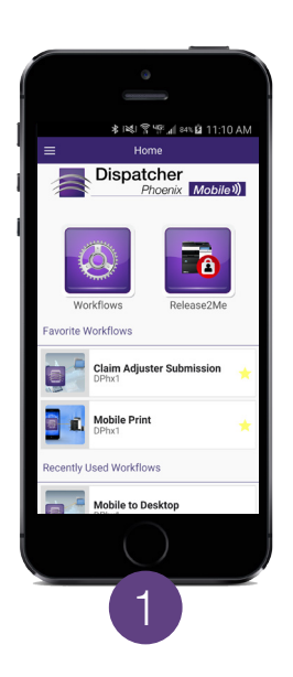
Access the Dispatcher Phoenix Mobile app on your smartphone screen and view all available workflows.

Along with all its benefits, Dispatcher Phoenix Mobile brings you another essential advantage: it's easy to use. An application dashboard can be customized to change the default view, show or hide components, and work the way you do. You can view available and favorite workflows, see details of your print jobs in queue for secure release, and easily navigate using slide-out sidebar design.